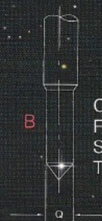
CYLINDRICAL FOOTSTEP SHAPE WITH TAPERED BLADE