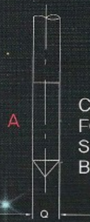
CONICAL FOOTSTEP SHAPE WITH BLADE TIP